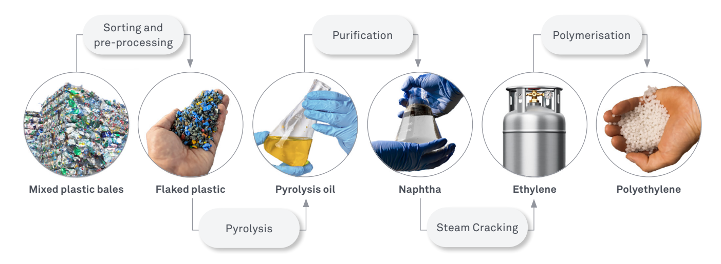
Figure 1. Process flow to chemically recycle mixed plastic waste to virgin quality polyethylene.

Feedstock containing oxygen (e.g. PET) and/or nitrogen (e.g. Nylon, ABS, urethane, aramid) are to be avoided. Together oxygen and nitrogen can form NOX which can create explosive compounds in the downstream section of a steam cracker. Nitrogen forms unwanted NH<sub>3</sub>. Feedstock containing chlorine (e.g. PVC) must be minimised as it forms highly corrosive HCl in